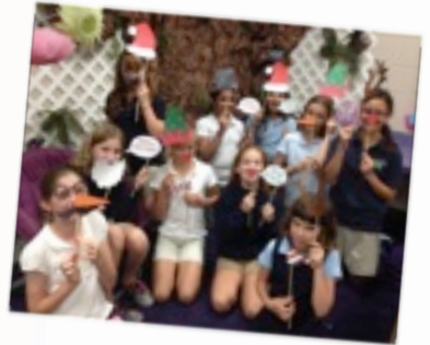
Fifth grade girls wishing you a Happy Holiday!