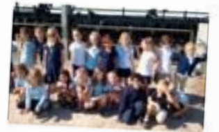
First grade Field Trip to Dakin Dairy Farm.