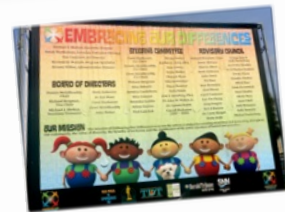
First graders visited "Embracing our Differences"