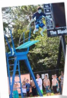
Fun in the sun at the 5th grade party!