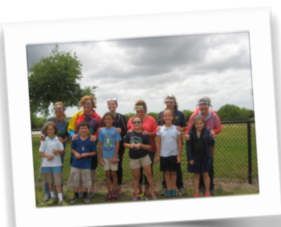
Fourth Grade Silly String fun!