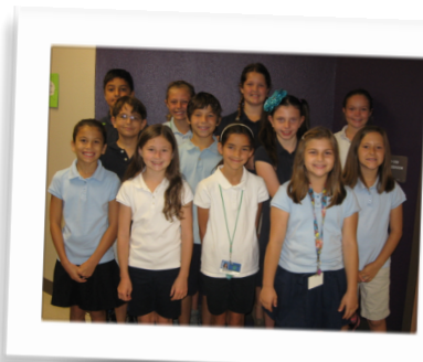
Tropicana Speech Winners!