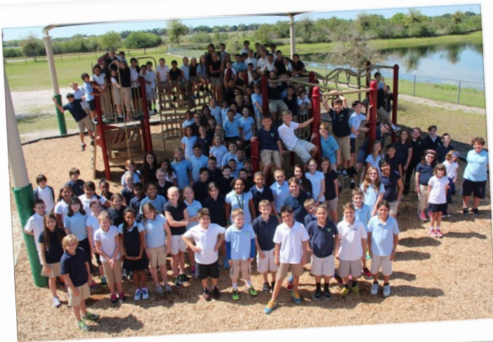
Class of 2014