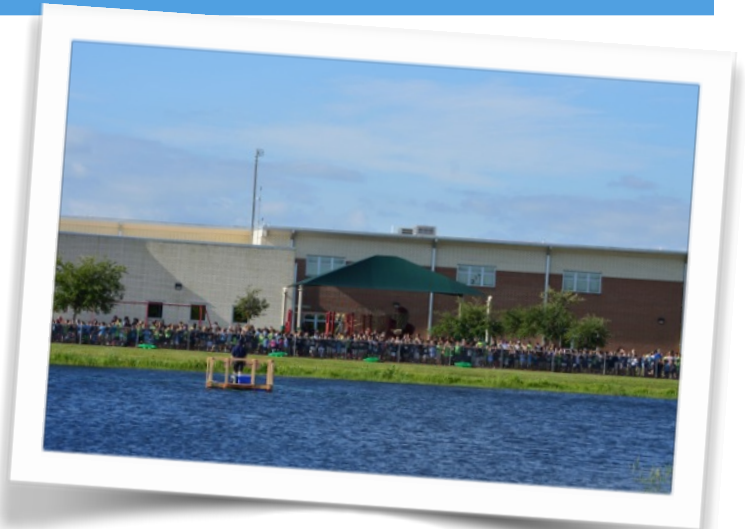
"On the Lake" Becomes a Reality

A big thank you to our over 70 volunteers and our vendor partners, Primrose School, Home Depot, 19 Sports, IMG Academy and Wal-Mart.