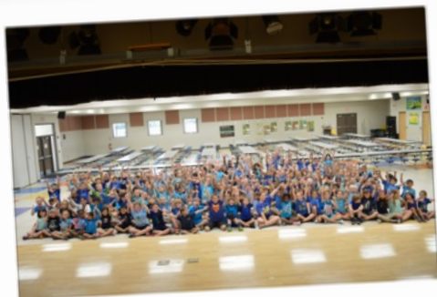
Congratulations to the Blue Team!