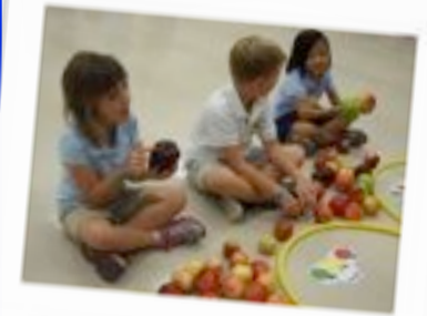
Kindergarten's celebrating at Apple Extravaganza!