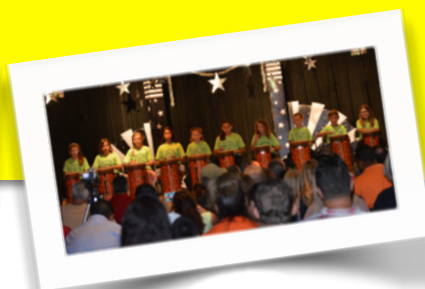
Talent Show 2015!