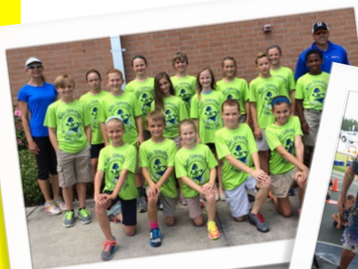
2015 Willis Track Team