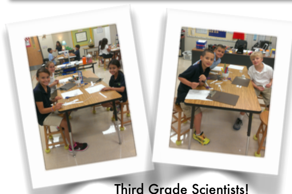
Third Grade Scientists!